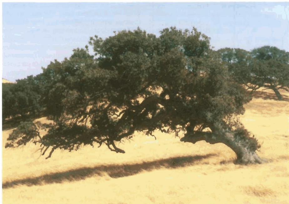
Fig. 1. A wind-sculpted 340-year-old blue oak ( Quercus douglasii ) at Pacheco State Park, California (view is toward the south). These moisture-stressed trees provide a superb ring-width proxy for regional precipitation, streamflow, and salinity in San Francisco Bay.

Blue oak trees often form the lower forest border on the foothills of the Coast Range and Sierra Nevada, a forest environment where blue oak radial growth critically depends on precipitation during the winter/spring/early-summer season. We have developed 12 new blue oak chronologies throughout the native range of this species in California, and these chronologies record one of the strongest precipitation signals ever detected in tree ring data. All 12 blue oak chronologies are significantly correlated with winter-spring salinity in San Francisco Bay but the highest correlations are recorded by the five chronologies closest to the Bay in central California (Figure 2). This contrasts somewhat with the spatial pattern of precipitation influence on salinity, because most of the freshwater inflow that controls salinity comes from more remote sectors of the drainage basin in the Sierra Nevada and Northern Coastal Range [e.g., Dettinger and Cayan, 2001].